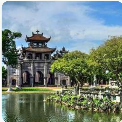
Phat Diem Cathedral