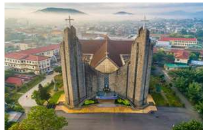
Phu Cam Cathedral