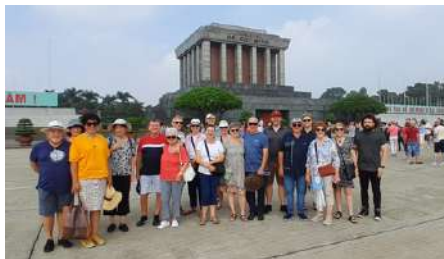
Ho Chi Minh Complex