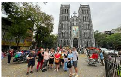
St. Joseph Cathedral

Flight: VN1547 HAN-HUI 1610-1725, airfare not included in package rate