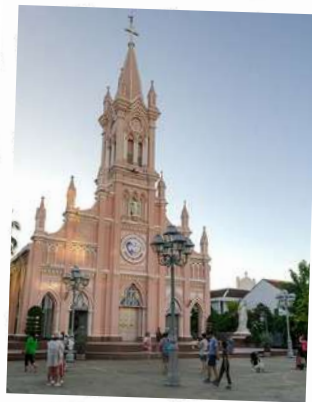
The Rooster church